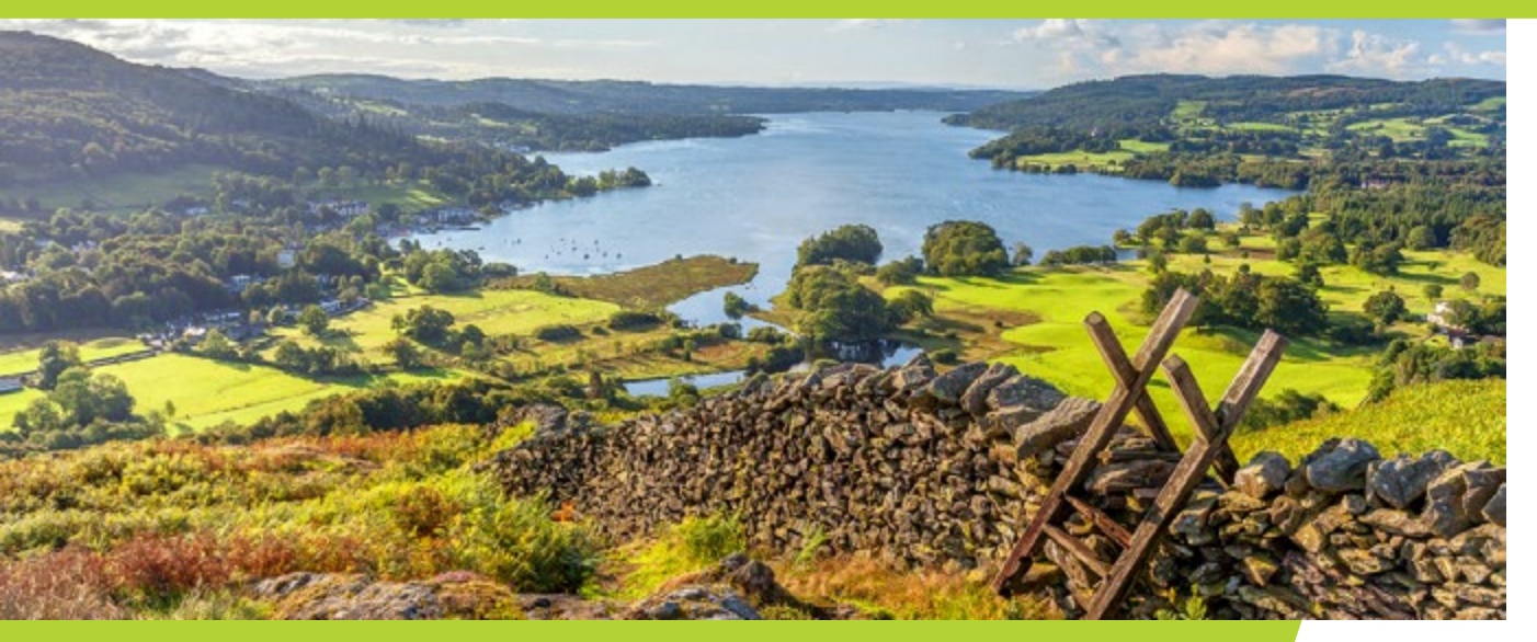
For full info, visit www.ultrachallenge.com/lake-district-challenge