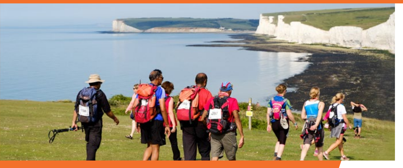
For full info, visit www.ultrachallenge.com/south-coast-challenge

Another real highlight of the season – and a truly magnificent challenge, taking on some of England's finest scenery as a Walk, Jog, or even a Run! It's an Eastbourne start, up Beachy Head, over the magnificent Seven Sisters, and along the South Downs Way with stunning views over the sea to a Brighton midpoint. Devil's Dyke, welcome rest stops, ups & downs all lie ahead before historic Arundel comes into view after an amazing 100 km journey for the 'full challenge' - and one you'll never forget. With fantastic ½ and ¼ Challenge options, camping packages at Eastbourne & Brighton - there really is something for everyone on this challenge!