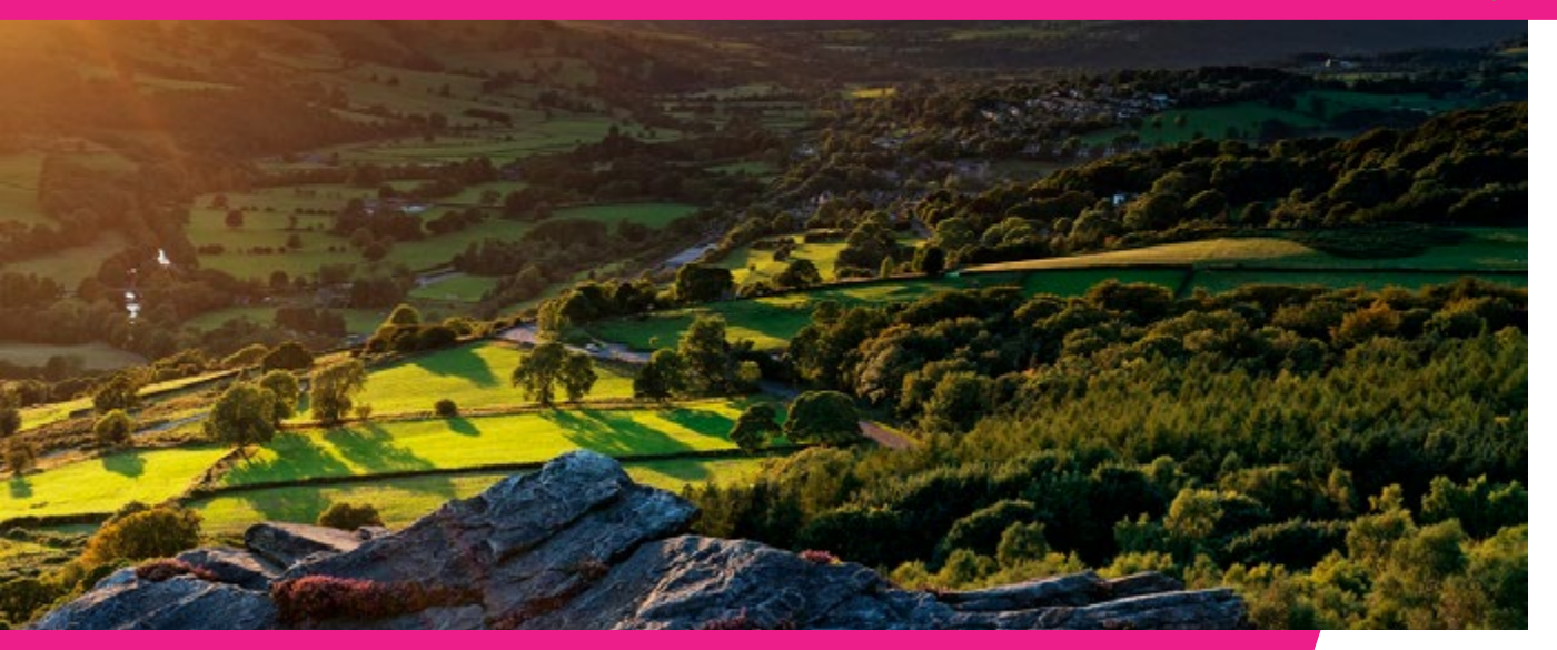
For full info, visit www.ultrachallenge.com/peak-district-challenge

Mid-summer - and a fantastic challenge in the middle of England! We'll welcome 2,500 or so adventurers into the fabulous Peak District National Park, with a major basecamp set-up in the idyllic town of Bakewell - with camping options across the weekend. The full 100km Challenge takes a tough & varied figure of 8 route through Derbyshire's finest scenery - passing Chatsworth House, viaducts, country estates, and high & low Dales, before returning to Bakewell for a fantastic finish line celebration. With distance options to suit everyone - make sure you're heading to Bakewell in early July to join in!