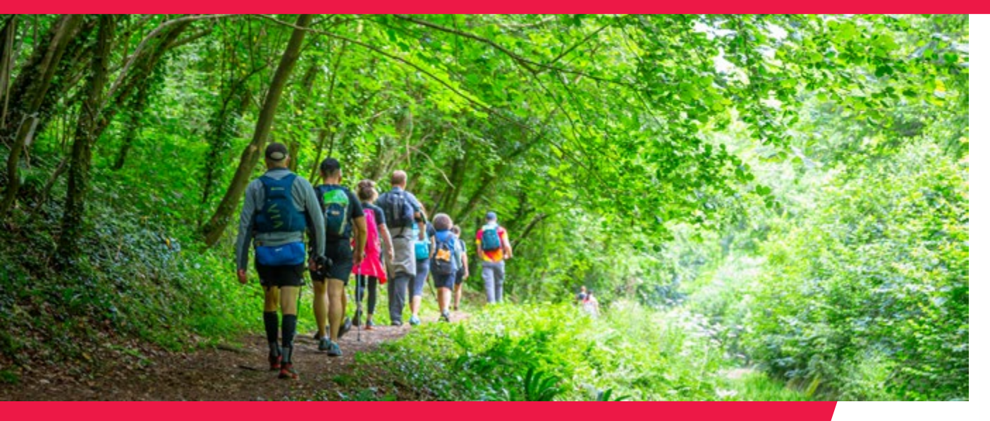
For full info, visit www.ultrachallenge.com/north-downs-50