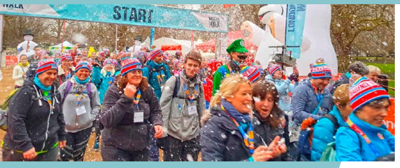
For full info, visit www.ultrachallenge.com/london-winter-walk